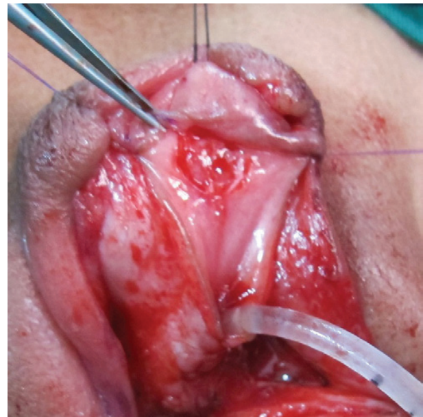
Figure 1. Penile hypospadias with small glans penis incision of the urethral plate prepared for skin grafting.