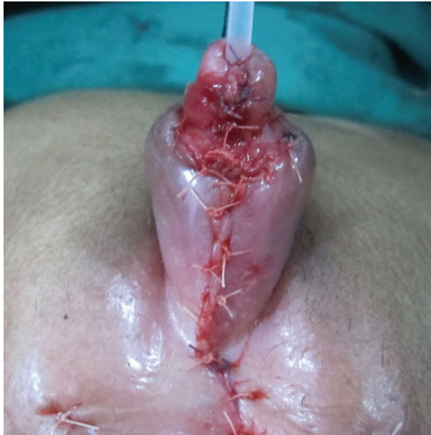
Figure 3. The glans penis could be closed comfortably over the tubularized incised grafted urethral plate.

dislodging the graft, calibration was not done in the first 2 post-operative weeks but at the 4 week OPD visit to evaluate the caliber of the meatus and the urethra.